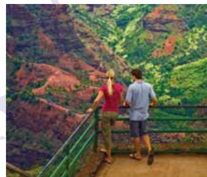
Waimea Canyon, nicknamed the Grand Canyon of the Pacific