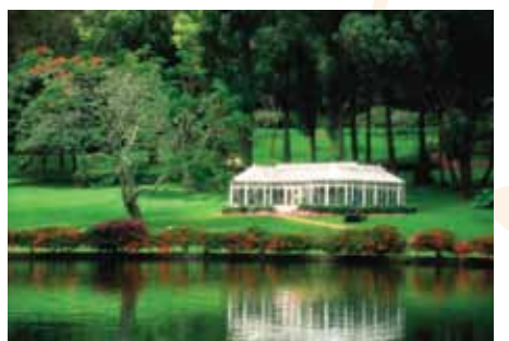
Orchid House at The Lodge at Koele

On the southern coast of Lāna'i, rising from the sea, is the iconic Pu'u Pehe (or Sweetheart Rock). This picturesque natural landmark is steeped in an Hawaiian legend that tells of two lovers, a maiden named Pehe and a young warrior named Makakehau, who are tragically separated when Pehe drowns in a storm. Stricken with grief, Makakehau climbs the steep rock island where he buries Pehe and then jumps into the pounding surf below.