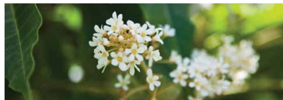
Island flower White Kukui Blossom