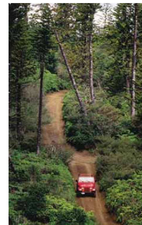
Images: Top: GOLF COURSE, Above: RAINFOREST TRACK